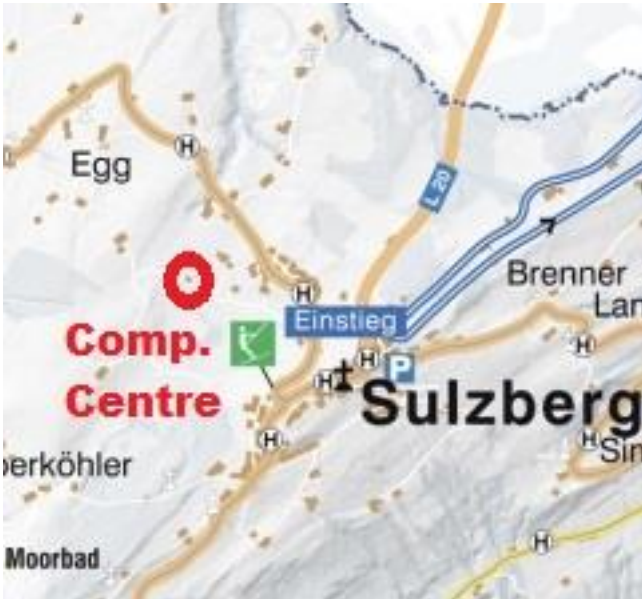
Nordic Sport Park, Sulzberg